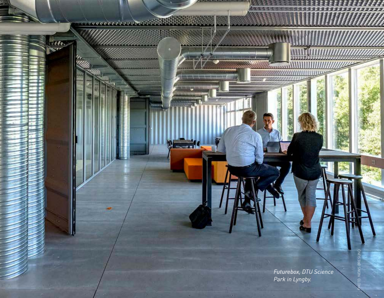
Futurebox, DTU Science Park in Lyngby.