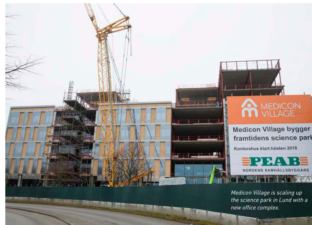
Medicon Village is scaling up the science park in Lund with a new office complex.