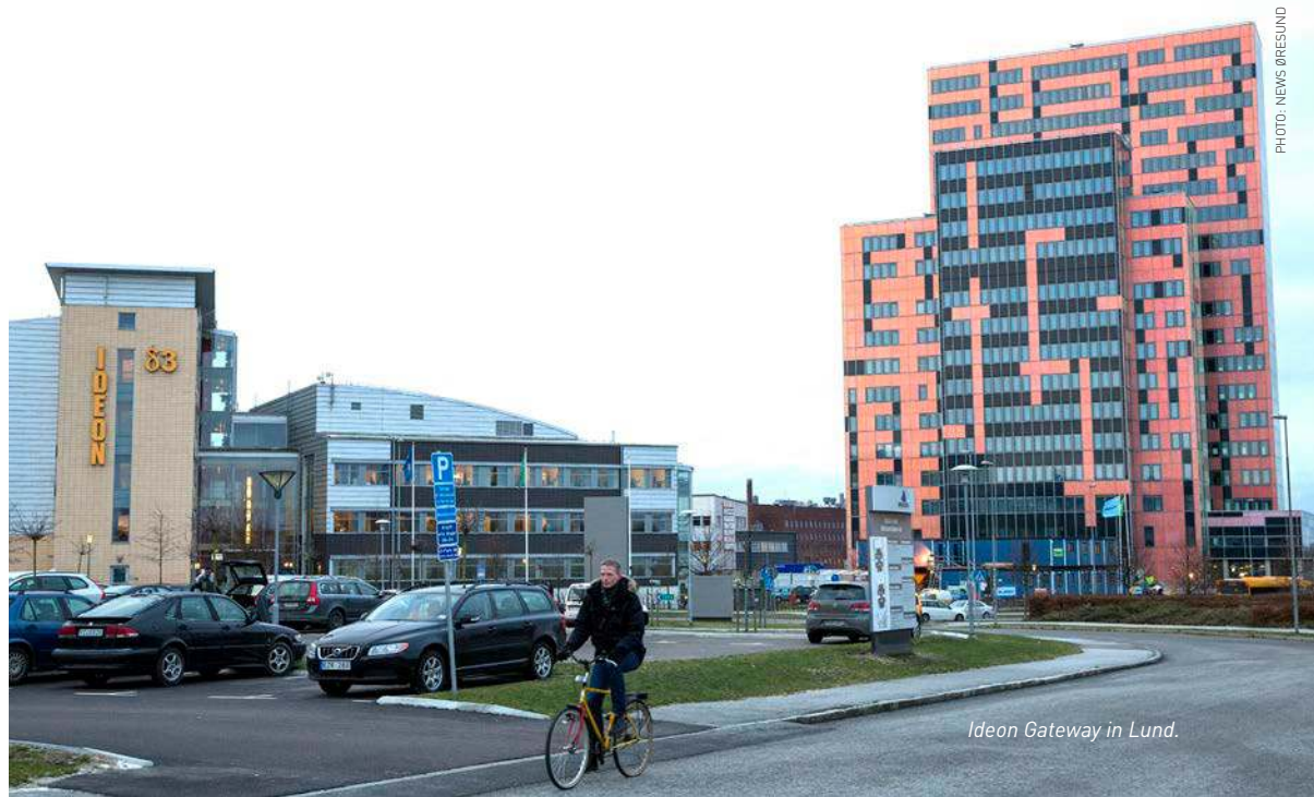
Ideon Gateway in Lund.